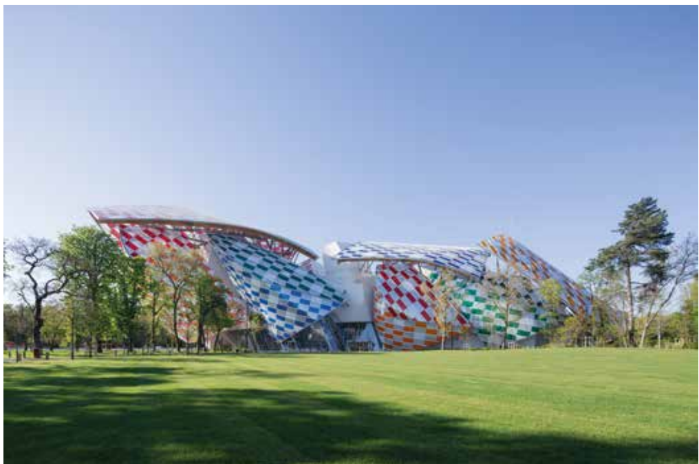
Photo-souvenir: Daniel Buren, «L'Observatoire de la lumière», work in situ, Fondation Louis Vuitton, Paris, 2016. Detail.