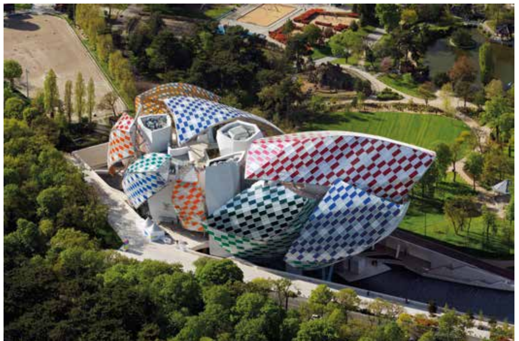
Photo-souvenir: Daniel Buren, «L'Observatoire de la lumière», work in situ, Fondation Louis Vuitton, Paris, 2016. Detail.