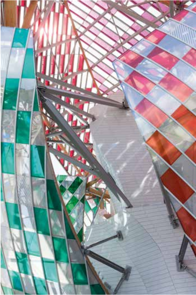
Photo-souvenir: Daniel Buren, «L'Observatoire de la lumière», work in situ, Fondation Louis Vuitton, Paris, 2016. Detail.