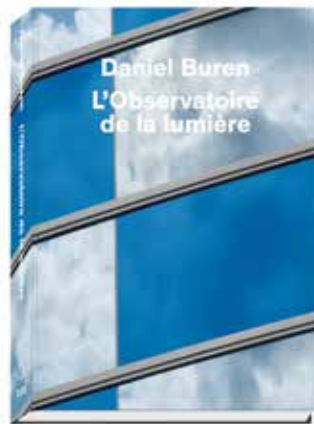
Daniel Buren « L'Observatoire de la lumière », Coédition Fondation Louis Vuitton / Editions Xavier Barral, Paris, 2016 456 pages 45 € TTC