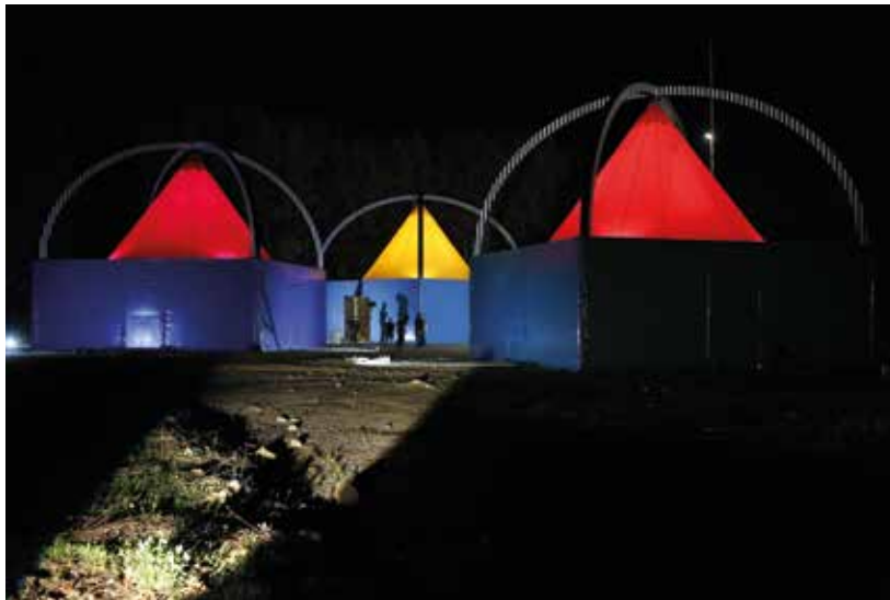
BurenCirque Cabanons