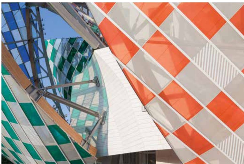
Photo-souvenir: Daniel Buren, «L'Observatoire de la lumière», work in situ, Fondation Louis Vuitton, Paris, 2016. Detail.