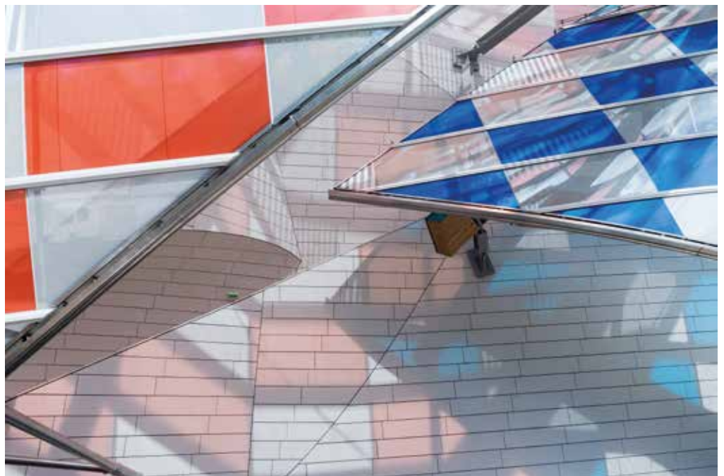
Photo-souvenir: Daniel Buren, «L'Observatoire de la lumière», work in situ, Fondation Louis Vuitton, Paris, 2016. Detail.