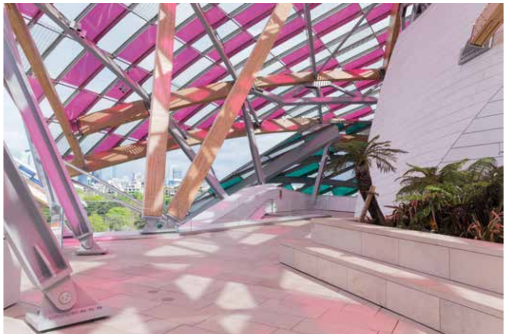
Photo-souvenir: Daniel Buren, «L'Observatoire de la lumière», work in situ, Fondation Louis Vuitton, Paris, 2016. Detail.