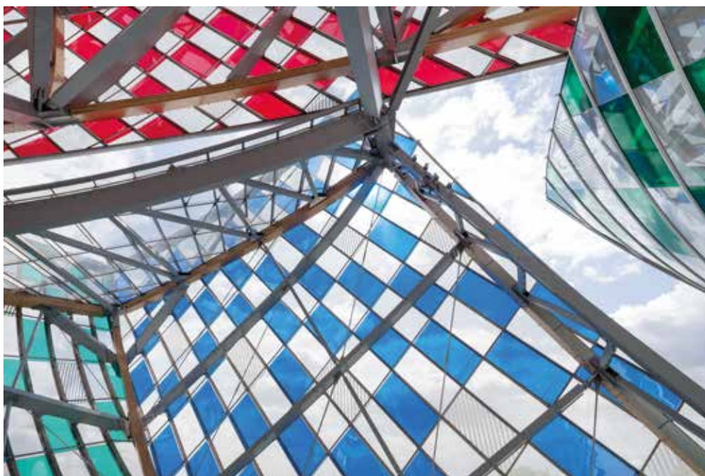
Photo-souvenir: Daniel Buren, «L'Observatoire de la lumière», work in situ, Fondation Louis Vuitton, Paris, 2016. Detail.