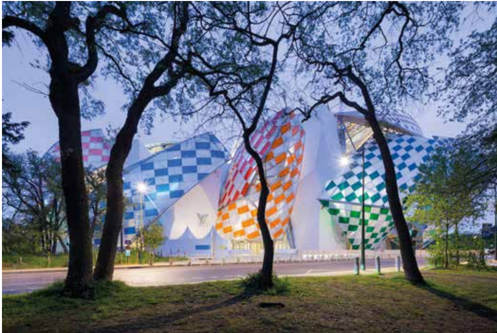
Photo-souvenir: Daniel Buren, «L'Observatoire de la lumière», work in situ, Fondation Louis Vuitton, Paris, 2016. Detail.