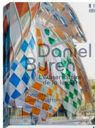
Daniel Buren « L'Observatoire de la lumière », publié à l'occasion de l'intervention à la Fondation Louis Vuitton Coédition Fondation Louis Vuitton / Beaux-Arts Éditions 64 pages 12 € TTC

Children's workshops — Children aged 6 – 10 will be able to enjoy the artist's work thanks to "The light trap", a workshop that will enable them to experience the multiple coloured facets of the Fondation Louis Vuitton, which will become a giant kaleidoscope. Tracking the projections and reflections during their discovery process, they will then have a chance to experiment in the workshop with how the play of transparency, opacity and colour modifies one's perception of space.