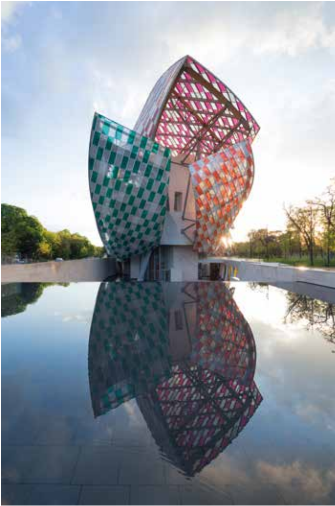
Photo-souvenir: Daniel Buren, «L'Observatoire de la lumière», work in situ, Fondation Louis Vuitton, Paris, 2016. Detail.