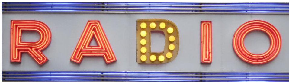
Photomontage © Anne-James Chaton