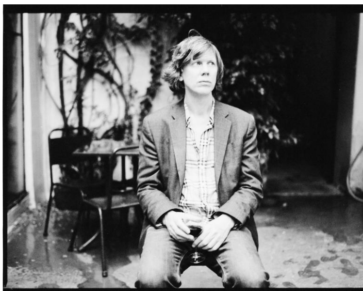
Thurston Moore